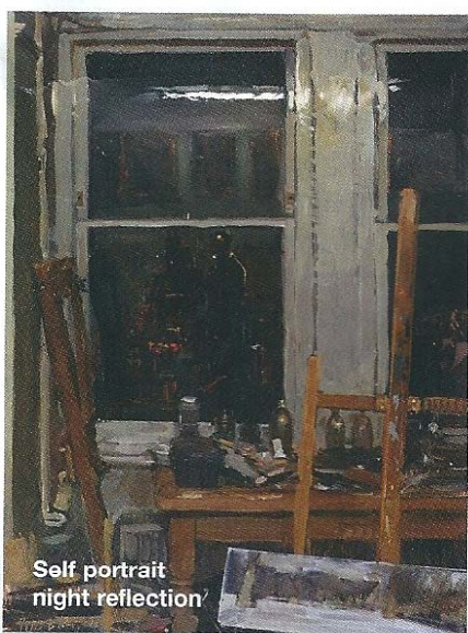
Self portrait night reflection

your brush. Snow is wonderful and sun is glorious. Changeable can be frustrating but can produce some good surprises. The one I really cannot crack, though, is wind – it's a nightmare!