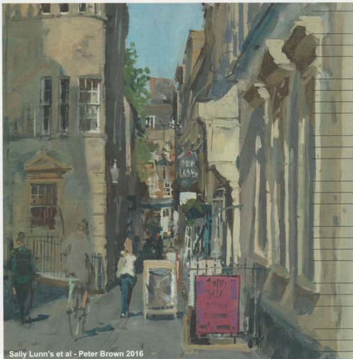
Sally Lunn's et al